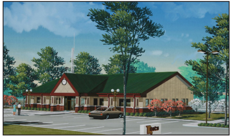
Artist rendering of the new operations facility.

In early 2022, OATS Transit purchased a property for a new operations facility in Lee's Summit MO, just off I-470. Construction is expected to begin in 2023 and is planned for completion in 2025. The facility will oversee specialized transportation in Jackson, Cass, Clay, and Platte counties. OATS Transit provides transportation for medical appointments, work, essential shopping, and more. In addition to rural service for individuals of any age, OATS Transit operates the RideKC buses in Lees Summit, which is a partnership with the City of Lee's Summit and the Kansas City Area Transit Authority.