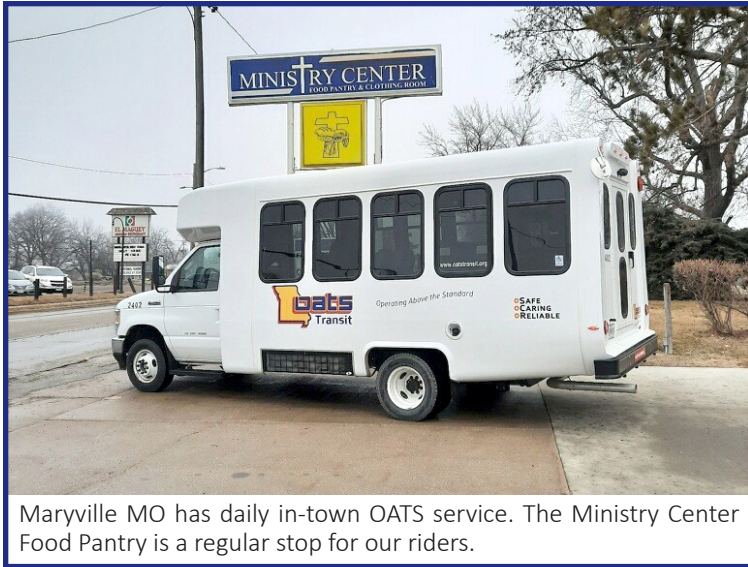
Maryville MO has daily in-town OATS service. The Ministry Center Food Pantry is a regular stop for our riders.