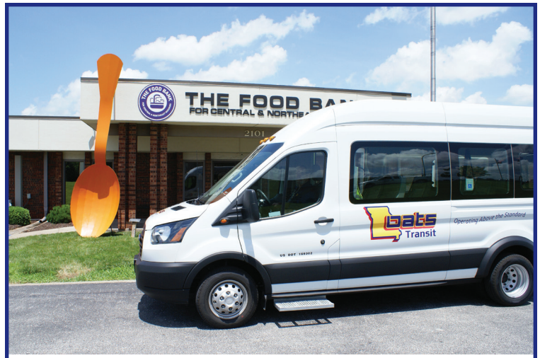
There are six Food Banks in Missouri that provide food to more than 1,500 Food Pantries in the state. This photo was taken at the Columbia MO Food Bank.

OATS Transit partners with hundreds of food pantries around the state to ensure no one goes hungry. For more information on transportation to a food pantry in your area, visit www.oatstransit.org , and click on the bus schedules tab or give us a call at 888-875-6287. If your local food pantry isn’t on our schedule, let them know why public transportation is important to you, and why they should partner with OATS Transit to get you and your family to their facility.