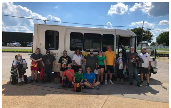
Lake Area Industries riders depend on OATS Transit to get to work daily.