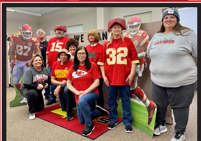
Our Northwest Region staff had lots of fun cheering on the KC Chiefs during SuperBowl LIX. The Chiefs didn't win this year, but we still love our Missouri team!

Please contact the editor if you have news stories or photos you would like to share with us. We would love to hear from you.